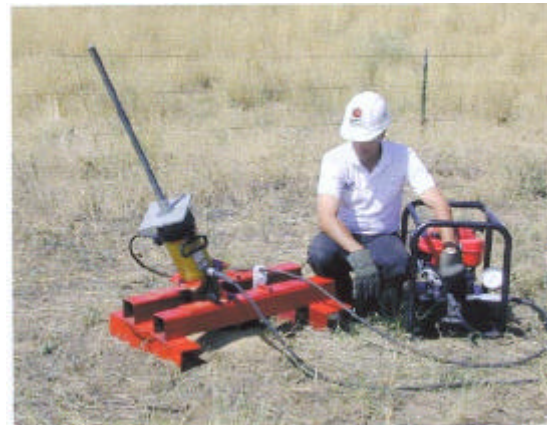
SR-LLK for Stingray

For Stingray, the SR-LLK is a 60-ton double acting jack with a 10-inch stroke, which includes a hydraulic power supply. It is available in two models, one for tower guy anchors and one for retaining wall tieback anchors.