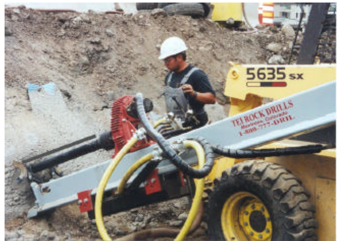
Down Hole Hammer