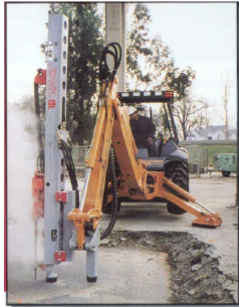
Top Hammer Rock Drill

Top Hammer or down-the-hole hammer rock drills are very effective for installation of Manta Ray and Stingray anchors. For hard soil or weak rock installations, the drill can be used to drill a pilot hole. Foresight can provide striker bar adapters for these types of drills. Rock drilling steel can also be modified to drive Manta Rays and Stingrays.